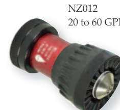
NZ012 20 to 60 GPM Nozzles