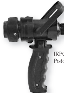
IRPG1P1P Pistol Grip Valve