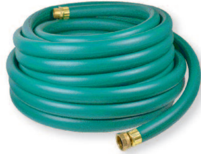
3/4" - 1" Dura Flow Irrigation Hose