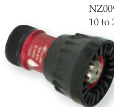
NZ009 10 to 24 GPM Nozzles