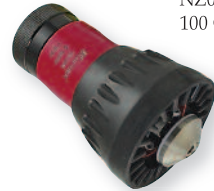
NZ030 100 GPM Nozzles