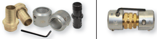
3/4" - 1" Field Repairable Couplings