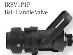
IRBV1P1P Bail Handle Valve