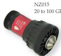
NZ015 20 to 100 GPM Nozzles