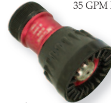
NZ010 35 GPM Nozzles