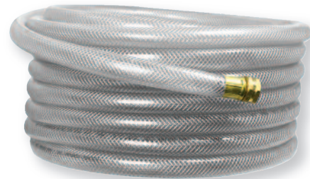
3/4" - 1" Clear Series Irrigation Hose