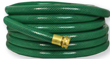
3/4" - 1" GH Series Irrigation Hose