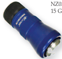
NZ033 15 GPM Nozzles