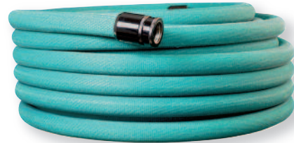
1" Ultra Lite High Pressure Irrigation Hose