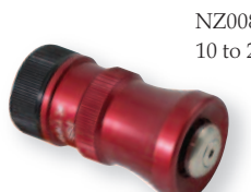
NZ008 10 to 25 GPM Nozzles